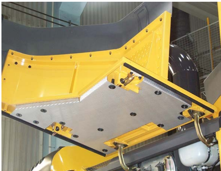
Acustimet mounted on the hinged part of the engine hood

Since 1997, Volvo and Scania have been pioneers in using these panels for lining engine compartments. EU directives on the flammability of materials used near engines for many years demands that these materials do not act as wicks to absorb fuels and oils.