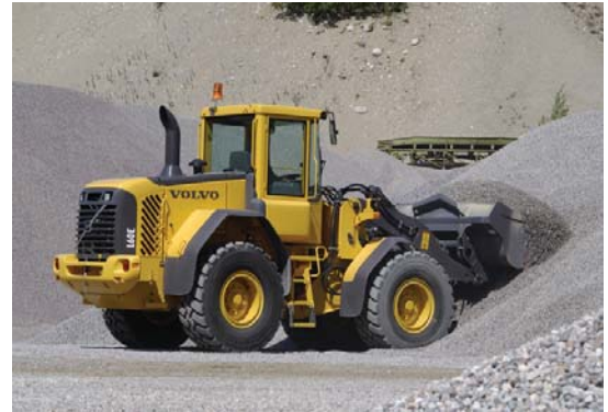
Volvo's wheeled loader uses Acustimet sound absorbers in the engine hood

The Acustimet material is normally mounted at 30-50mm distance from the engine compartment walls, as can be seen in Figures 1 & 2. The absorption factor calculated for a 50mm air-gap application is shown in Figure 3(?)