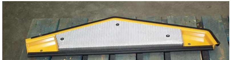
Acustimet mounted on the fixed part of the engine hood

In the cabin, where more and more of the